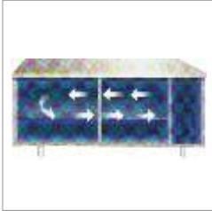
Air-flow in Undercounters

Celfrost Professional Prep Counters and Counter Top Displays bring in a unique experience in the preparation of pizzas, salads, starters, snacks, sandwiches, desserts and many other ethnic dishes. Built entirely in stainless steel, the Counter Top Display is equipped with its own refrigeration unit and is suitable for Gastronorm pans (not included).