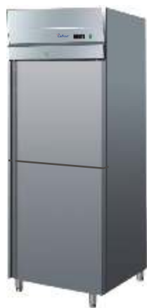
GN 650TNM (New) GN 650BTM (New)