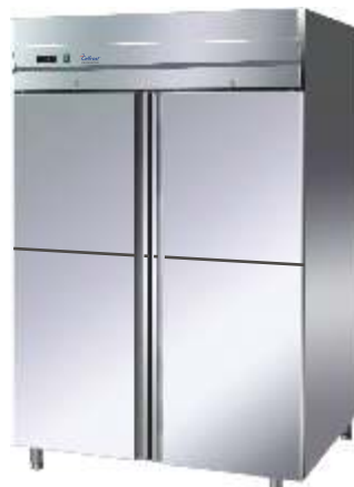
GN 1410TNM (New) GN 1410BTM (New)