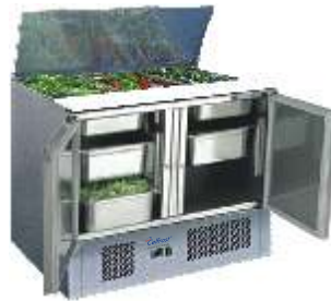
S 900 Saladettes