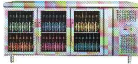
GN 3100 TNG