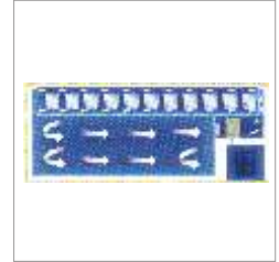
Air-flow in Prep Counters