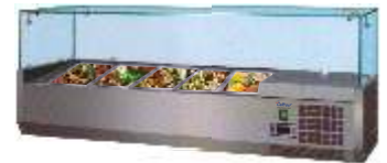
VRX-1200 (with Glass Sneeze-guard)