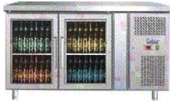
GN 2100 TNG