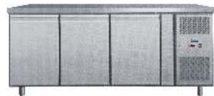
GN 3100 TN GN 3100 BT