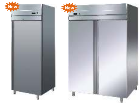
GN 700TN GN 700 BT