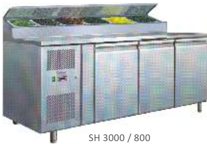
SH 3000 / 800 Prep Counters