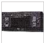
Digital temperature controller & display