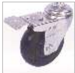
Lockable swivel castors