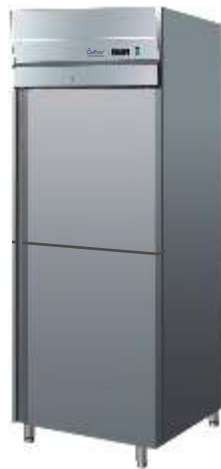
GN 650TNM (New) / GN 650BTM (New)