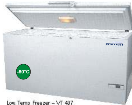
Low Temp Freezer – VT 407

An integrated lock prevents unauthorised access to the contents of the low- temperature freezer.