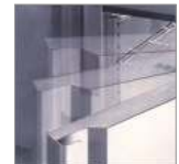
Energy-efficient, self-closing doors