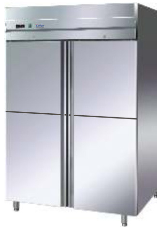
GN 1410TNM (New) / GN 1410BTM (New)