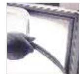
Removable door gasket for easy cleaning