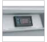
Optional digital temperature controller & display