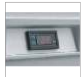
Optional digital temperature controller & display