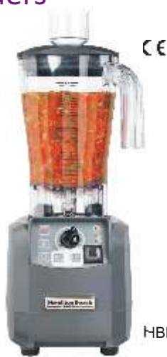
HBF 600 CE

These heavy duty blender mixers from Hamilton Beach offer professional chefs the confidence to blend, chop, grind and puree for successful food preparation.