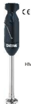
HMI 200 CE