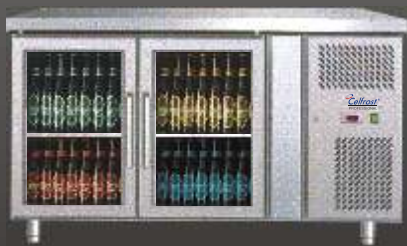
Undercounter Back Bar (GN 2100 TNG)

Elegant yet reliable Undercounter Back Bars made in sturdy stainless steel that are designed to enhance the efficiency of professional bartenders. Perfect for showcasing bottled and canned drinks and giving you high capacity & high visibility storage and display options.