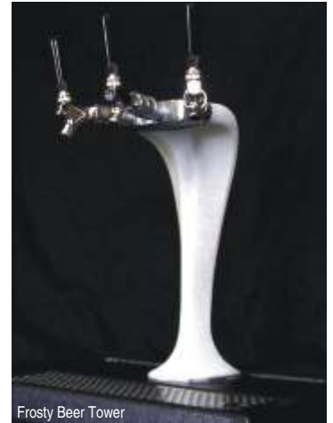
Frosty Beer Tower

As a part of a global trend, every brewer across the world has watched the popularity of their extra cold product offering soar. This is mainly due to integration of worldwide consumer tastes and their increasing preference and familiarity with lager served, icy cold. Celfrost presents the science behind the coolest brands with its inventive and leading edge products.