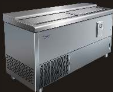
Top Loading Bottle Cooler (B - 1500)

A range of top loading bottle coolers and chest coolers, designed for quick service and easy restocking of chilled beer and beverage bottles. B-1500 comes with a bottle opener.