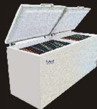
Chest Cooler (CF - 500)