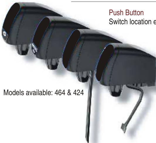
Models available: 464 & 424