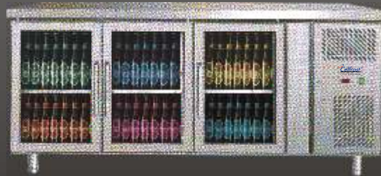
Undercounter Back Bar (GN 3100 TNG)