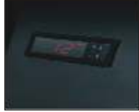
Digital Temperature Indicator in W 185 and digital temperature setting in W-43, 72 and 120 models.

Wines develop their full flavour when they are at the right temperature for drinking. Our international quality wine coolers guarantee the perfect conditions for professional storage of red, white and sparkling wines. A wide range facilitates exactly the right model for every need.