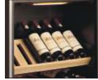
Attractive LED light and a tilted top shelf now available with W-185.