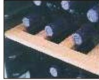
Height adjustable wooden shelves prevent vibration of wine during cabinet operation leaving the wine to mature in peace. Available in all models.