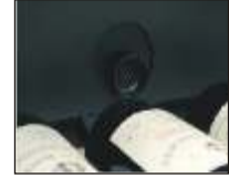
A charcoal filter cleanses the air, preventing bad odours from penetrating through the cork and affecting the wine. (Available in W 185)

Leading brands like ITC, Taj Group, Crowne Plaza, Fortune Hotels, Park Plaza, Ramada, Holiday Inn, ITDC, GRT Hotels are just some of the names in our growing list of satisfied customers.